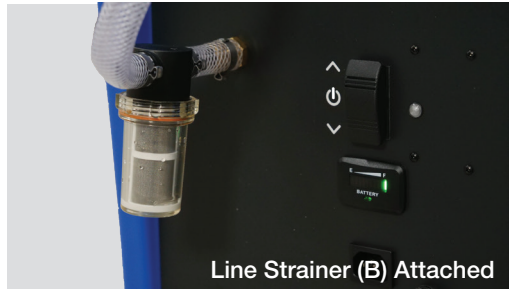
Line Strainer (B) Attached

Note: Pictures may differ slightly from your specific application.