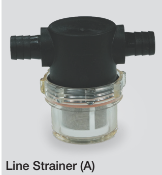
Line Strainer (A)

Clean or replace all strainers as necessary. Failure to do so can cause a reduction in the water pressure and flow rates needed to operate the system properly.