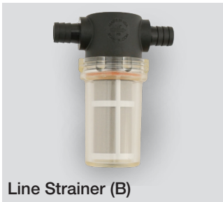
Line Strainer (B)