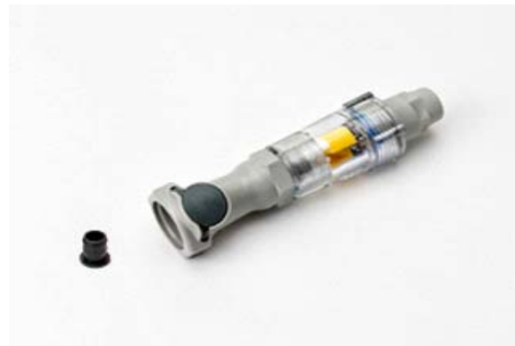
FLT-071 Replacement Front End for Stealth Water Supplies