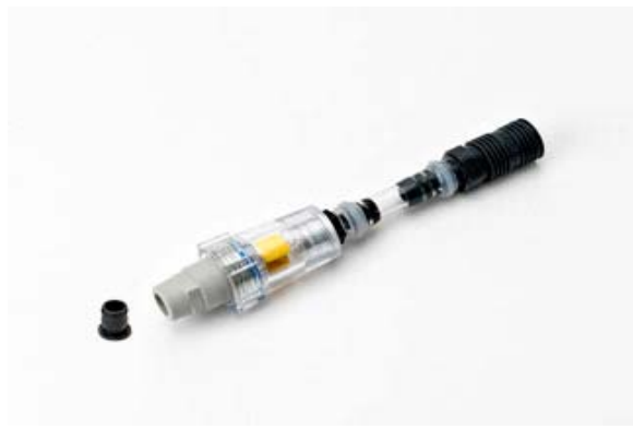
FLT-071A Replacement Front End for Stealth Water Supplies (BFS™ compatible)