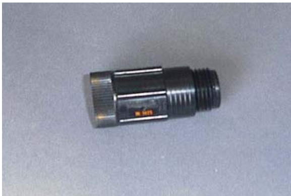
FLT-060 Pressure Regulator, 25 P.S.I.