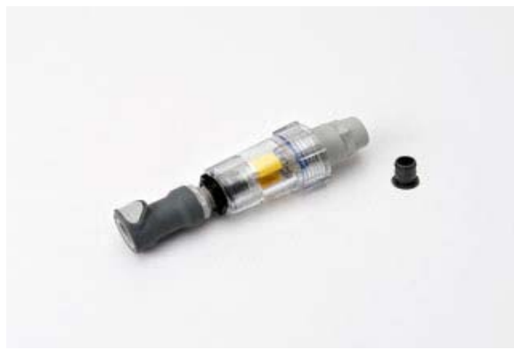
FLT-071E Replacement Front End for Stealth Water Supplies (BWT™ compatible)