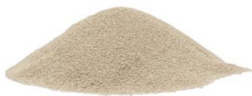
Molecular Sieve 5A

Molecular sieves are synthetic aluminosilicates of sodium, potassium or calcium, of various pore sizes. The pores are precisely uniform in size. Molecular Sieves are used to separate the fixed gases. CO, CH 4 , O 2 and Ar are easily separated at room temperature. 100 g/ bottle