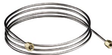
Packed GC Column