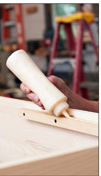
▲ Lay a bead of glue on each of the 8 ribs that will secure the floor.

◄ Flip the casket over to install the floor panels.