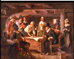
Signing the Mayflower Compact

The Mayflower Compact was signed on board the Mayflower at Cape Cod on November 21, 1620 by 41 men and contains less than two hundred words.