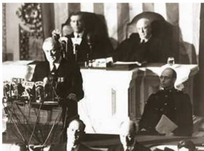
President Roosevelt delivering his "Day of Infamy" speech to a joint session of Congress.