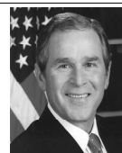
George W. Bush

Democracy is a system of government by which political sovereignty is retained by the people and either exercised directly by citizens or through their elected representatives.