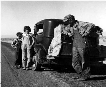
The Great Depression

The Great Depression was one of the most difficult times in the 20 th century. Many people lost their job and even their home. Many went hungry. The Depression lasted through much of the 1930's.