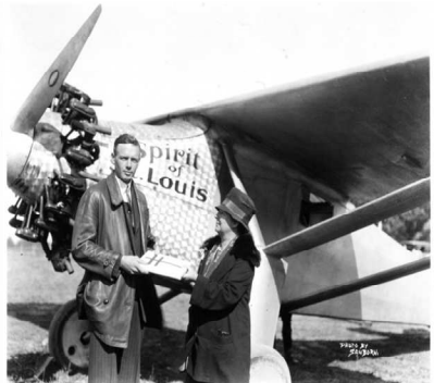
The Spirit of St. Louis

Charles Lindbergh made the first flight across the Atlantic Ocean. He won a prize of $25,000 and went from being a stunt pilot to an American hero.