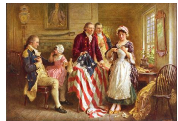
George Washington liked the flag Betsy made.