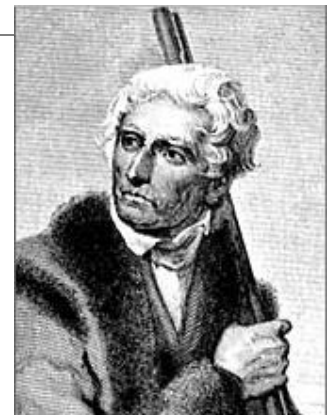
Daniel Boone is known as one of the most famous pioneers of history.

What was Daniel Boone famous for wearing?