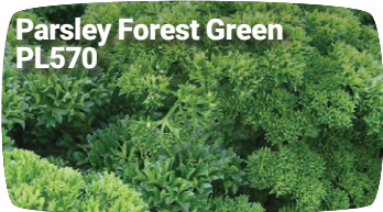
Parsley Forest Green PL570