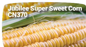
Jubilee Super Sweet Corn CN370