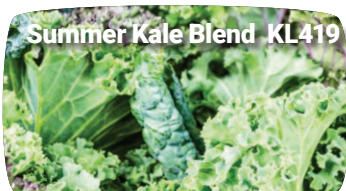
Summer Kale Blend KL419