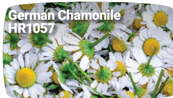
German Chamomile HR1057