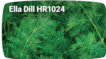
Ella Dill HR1024