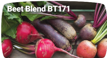
Beet Blend BT171