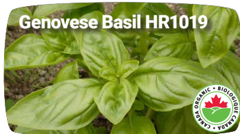
Genovese Basil HR1019