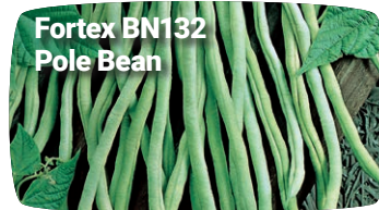
Fortex BN132 Pole Bean