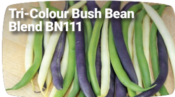
Tri-Colour Bush Bean Blend BN111