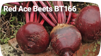
Red Ace Beets BT166