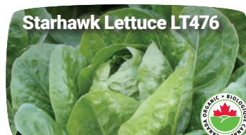
Starhawk Lettuce LT476