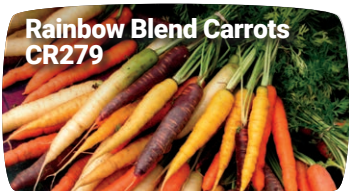
Rainbow Blend Carrots CR279