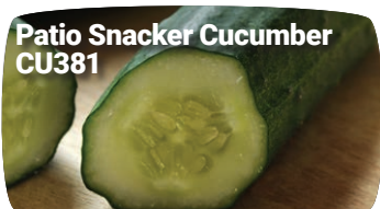
Patio Snacker Cucumber CU381