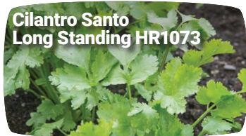
Cilantro Santo Long Standing HR1073