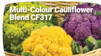
Multi-Colour Cauliflower Blend CF317