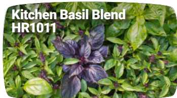
Kitchen Basil Blend HR1011

Each seed packet sold will earn you 40% profit off the packet price.