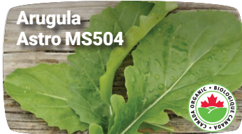
Arugula Astro MS504