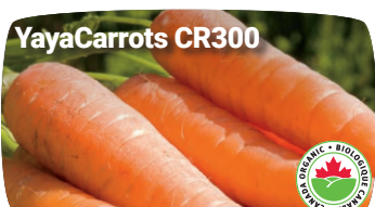
Yaya Carrots CR300