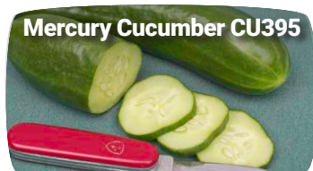
Mercury Cucumber CU395