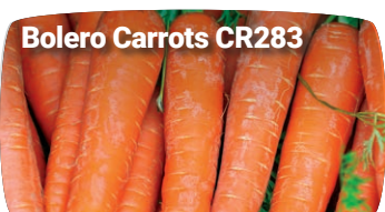
Bolero Carrots CR283