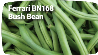
Ferrari BN168 Bush Bean