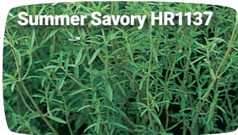
Summer Savory HR1137