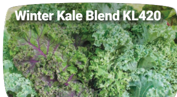
Winter Kale Blend KL420