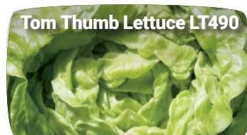
Tom Thumb Lettuce LT490