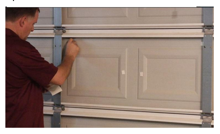
For improved thermal performance, add 3/4" air space between Reflective Air and door. This can be done by attaching to door framing rather than to the door panel

Begin by cleaning the surface of the inside door panels where the adhesive squares (Stick'ems<sup>™</sup>) will be used to hold the radiant barrier panels in place.