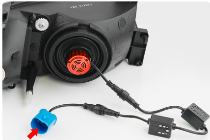
Plug in the factory connector