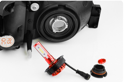
Slide on the factory retaining ring