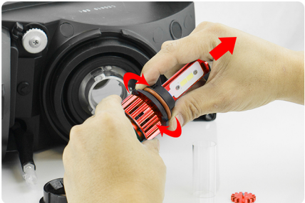
After removing the sleeve, remove the base