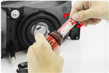
Remove the retaining screw and remove the sleeve