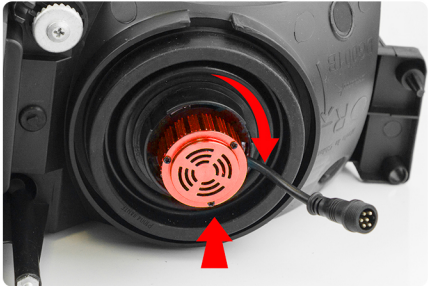
Align the bulb with the slots in the housing and once the slots are aligned, push the bulb in with ease. Once the bulb is all the way in, twist and lock the retaining ring