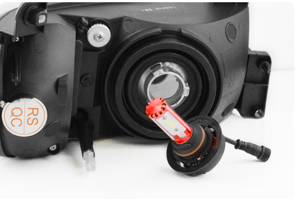
Reassemble the base and the sleeve