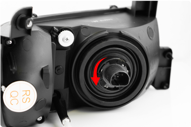
Disconnect the factory connect and remove the OEM halogen bulb by twisting off the retaining ring, then pull the bulb out