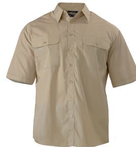
BS1526 PERMANENT PRESS SS