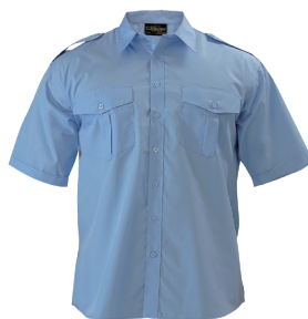
B71526 EPAULETTE SHIRT SS