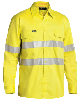
BS6445T 3M TAPED HI VIS INDUSTRIAL COOL L/W SHIRT LS