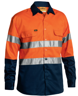
BT6456 3M TAPED 2 TONE HI VIS DRILL SHIRT LS