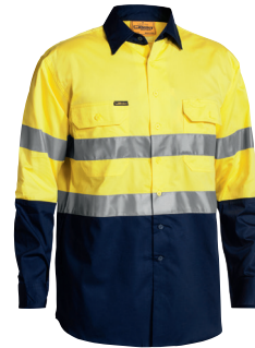
BS6896 3M TAPED 2T HI VIS COOL L/W SHIRT