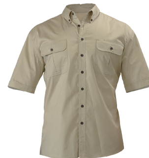
BS1255 MINI TWILL SHIRT SS