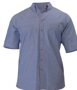
B71407 CHAMBRAY SHIRT SS