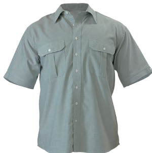
BS1030 OXFORD SHIRT SS