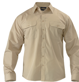
BS6526 PERMANENT PRESS LS