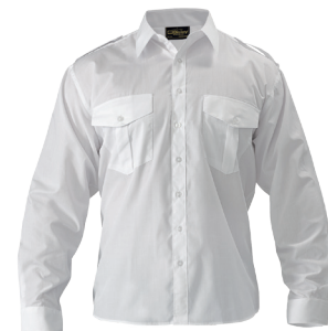
B76526 EPAULETTE SHIRT LS