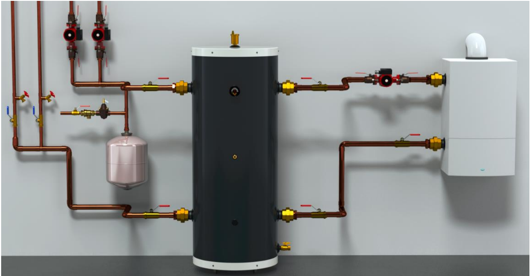
Figure 1: BUFFMAX Typical Installation