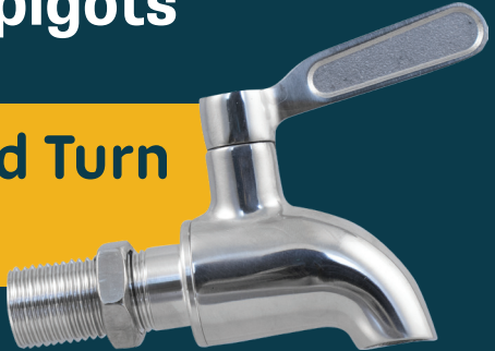
Back Twist Spigot