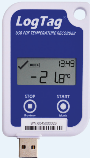
Rated Absolute Accuracy