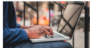
The 25 best NYC neighborhood blogs in 2016 Your digital dossier of all the ground NYC news online. BRICKUNDERGROUND.COM

NAMED ONE OF THE BEST NYC NEIGHBORHOOD BLOGS IN 2016