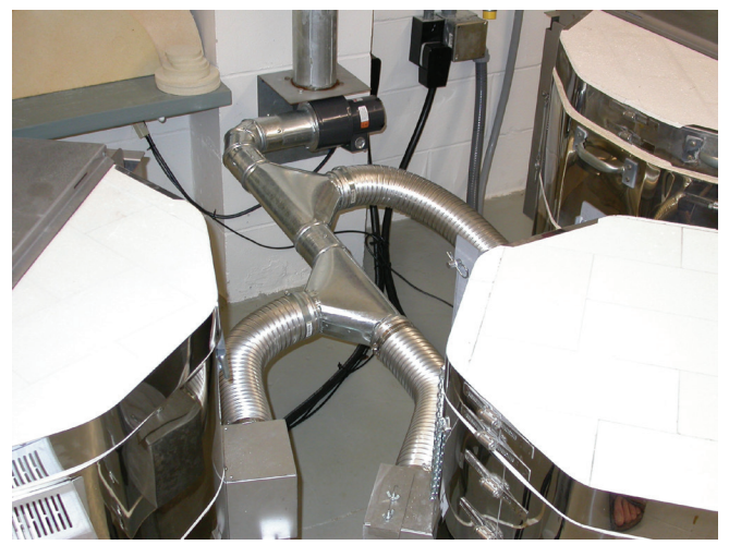
This shows several small kilns hooked up with one Vent-Sure using two Vent-Doublers. (Up to 20 cubic feet can be ventilated with one vent).

Note: These Frequently Asked Questions are provided courtesy of The Edward Orton Jr. Ceramic Foundation with some modification based on our Vent-Sure vent system and experience.