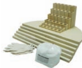
Furniture kit for a e28S-3 kiln.

Quad Element Design: Extra long element life ( hotkilns.com/quad-element-option )