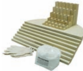
Furniture kit for a e28T-3 kiln.