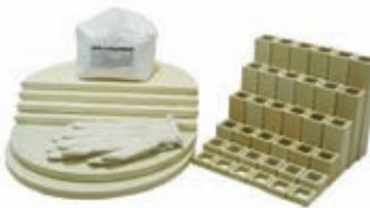
Furniture kit for a e18T kiln