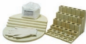
Furniture kit for a e18S kiln

Furniture Kits: Shelves are high alumina cone 11 shelves. Shelves are 15" diameter for kilns with 3" brick and 15.5" diameter for kilns with 2.5" brick. Full and half round cordierite shelves. Each post kit includes six each 1/2", 1", 2" 4", 6" and 8" high 1-1/2" square cordierite posts. All furniture kits include heat-resistant gloves.