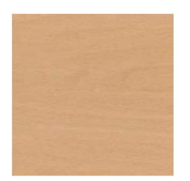
NATURAL BEECH lacquer/oil