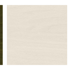
S110 LIGHT WHITE beech/oak