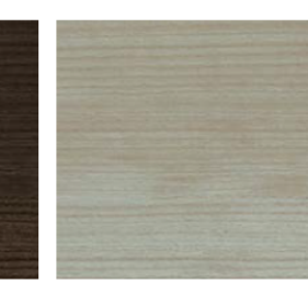
W520 OIL MISTY GREEN beech/oak