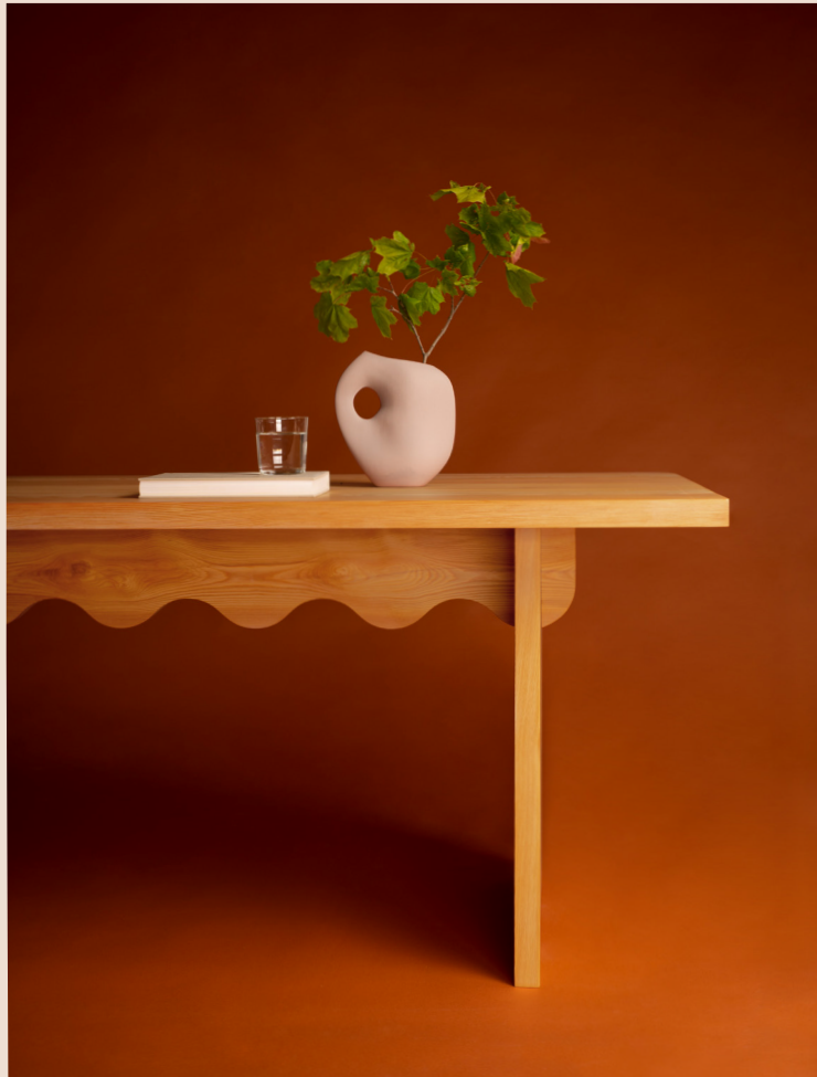
Tami table from larch wood

Inspired by the evenly rising and falling tones of rhythmical structures that unite human individuals into a common collective identity, the Tami Dining Collection from naturally oiled larch or oak wood creates a place to gather, share and trust.