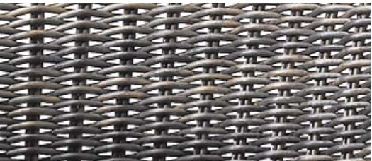
SYNTHETIC FIBRE BROWNISH BLACK (outdoor)