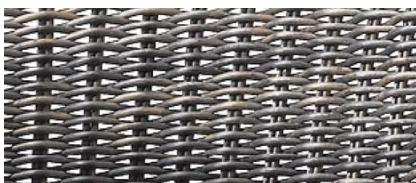
RATTAN DARK BROWN