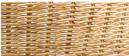
NATURAL RATTAN (color may vary)