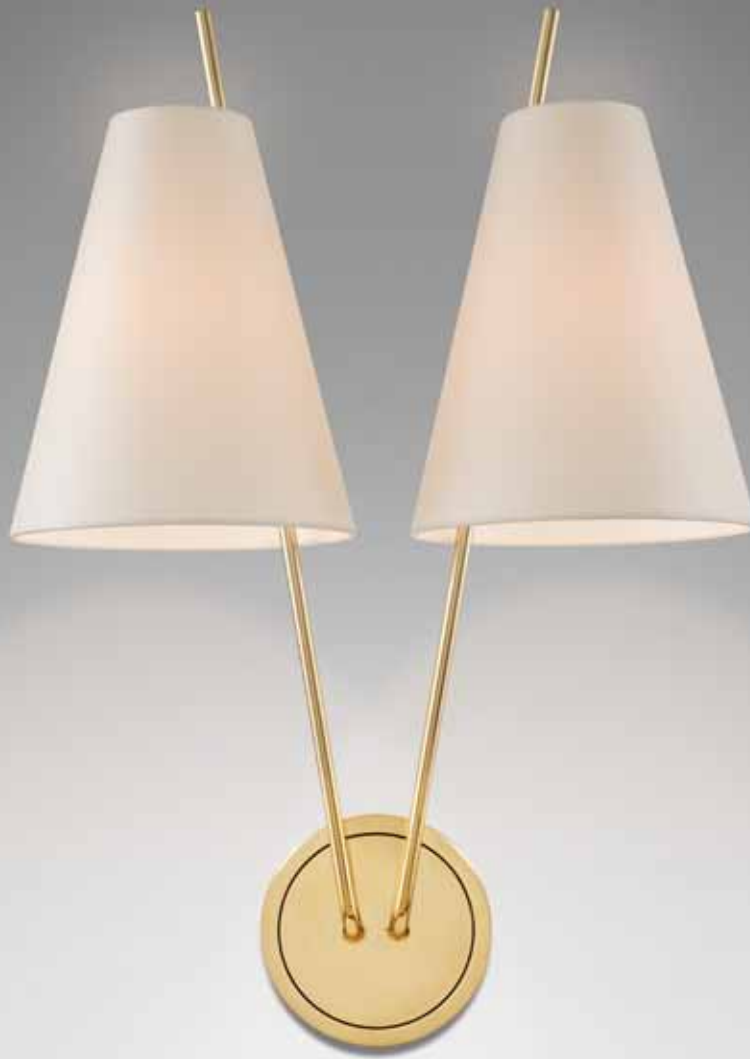
Polished Brass | Silk