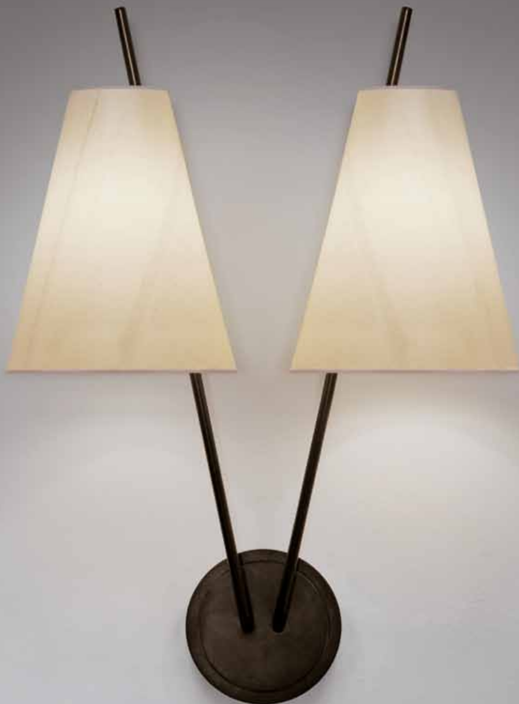
Black Bronze with Highlighted Edges | Silk