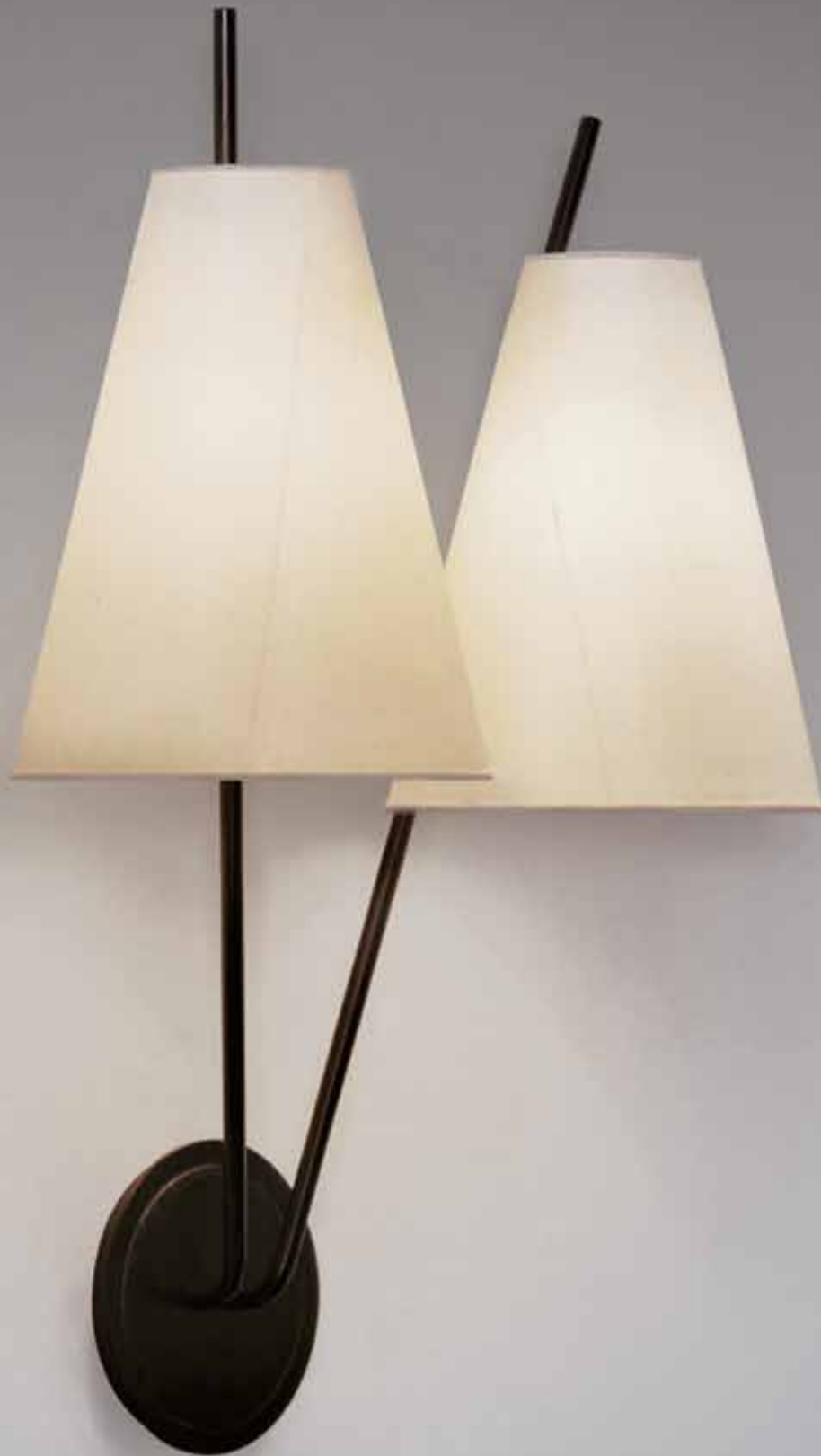
Black Bronze with Highlighted Edges | Silk