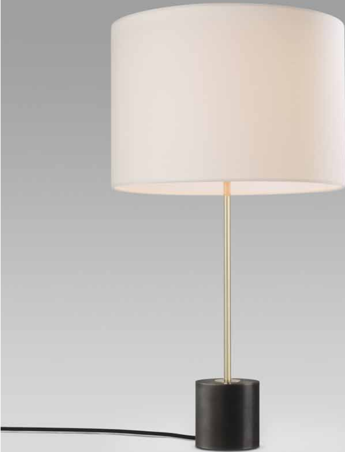
Polished Brass | Blackened Steel