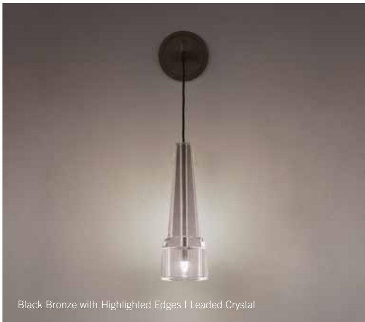
Black Bronze with Highlighted Edges | Leaded Crystal