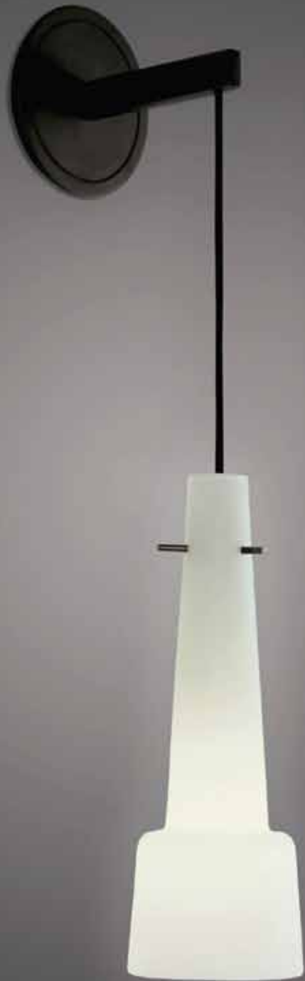
Black Bronze with Highlighted Edges | Satin Opal