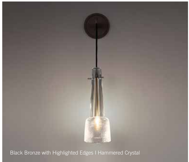
Black Bronze with Highlighted Edges | Hammered Crystal