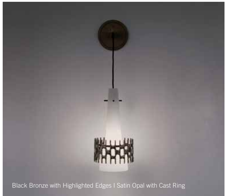
Black Bronze with Highlighted Edges | Satin Opal with Cast Ring