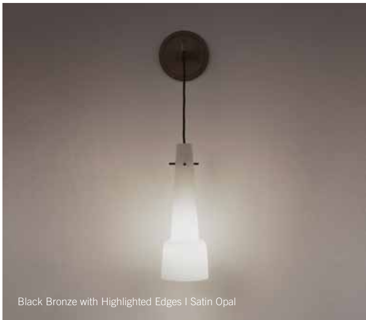
Black Bronze with Highlighted Edges | Satin Opal