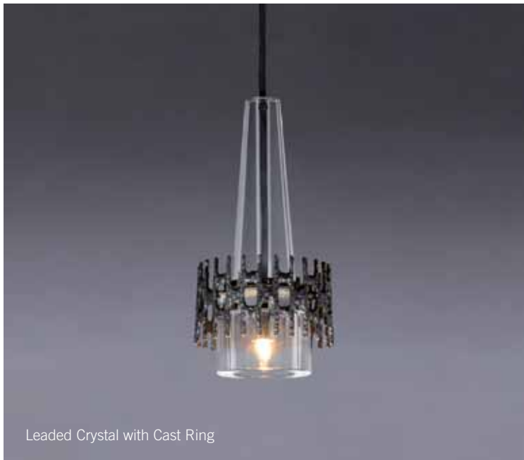
Leaded Crystal with Cast Ring