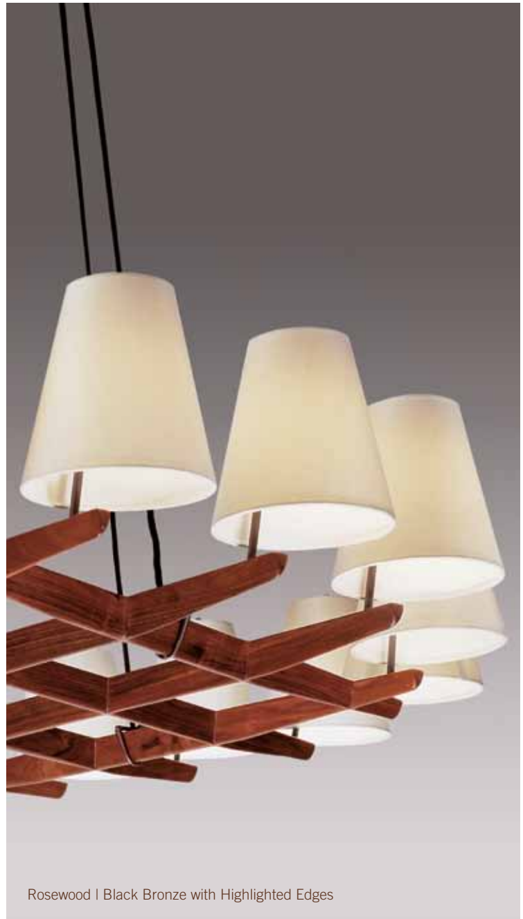
Rosewood | Black Bronze with Highlighted Edges