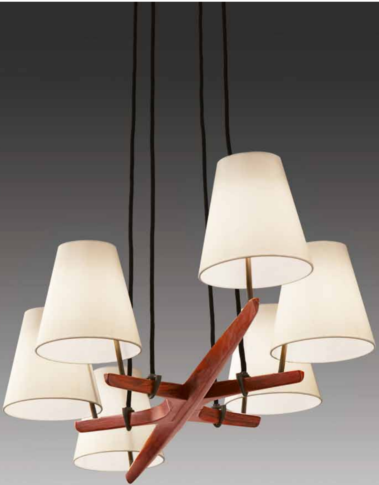
Rosewood | Black Bronze with Highlighted Edges