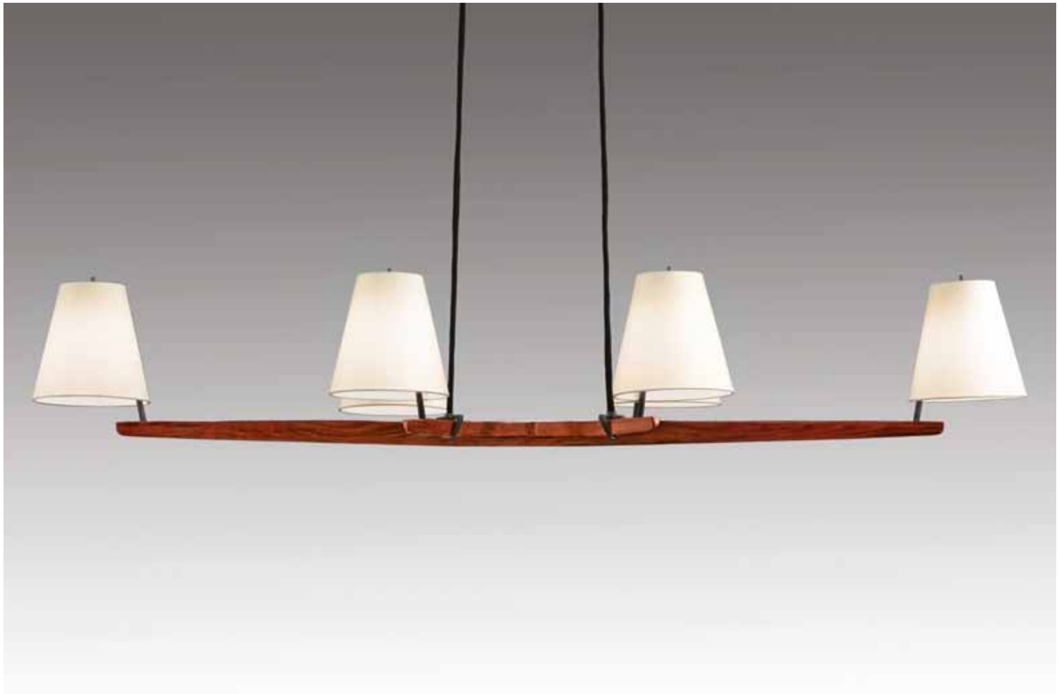
Rosewood I Black Bronze with Highlighted Edges