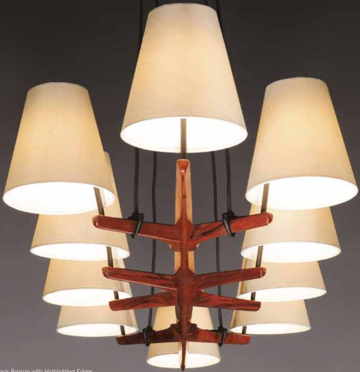
Rosewood | Black Bronze with Highlighted Edges