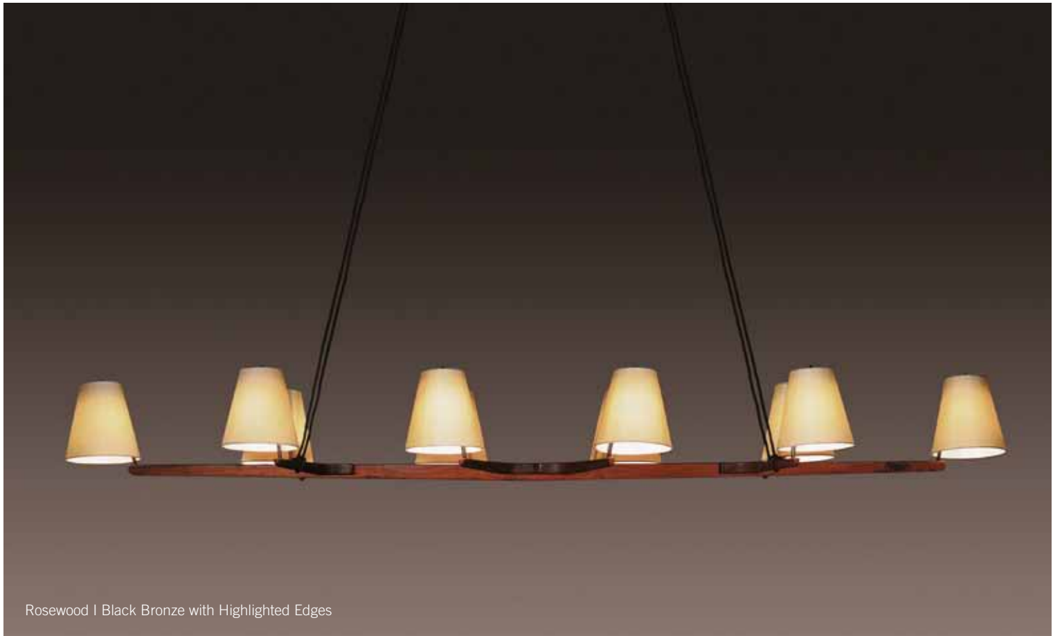
Rosewood I Black Bronze with Highlighted Edges