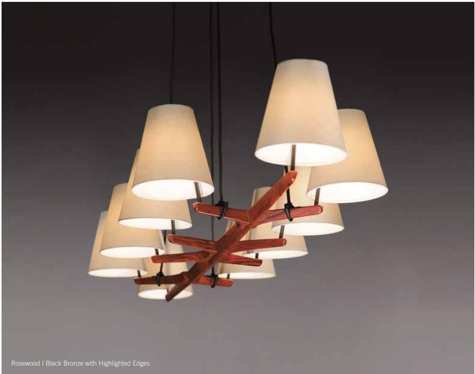
Rosewood I Black Bronze with Highlighted Edges