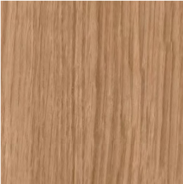
OAK NATURAL LACQUERED