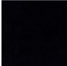
OAK STAINED BLACK