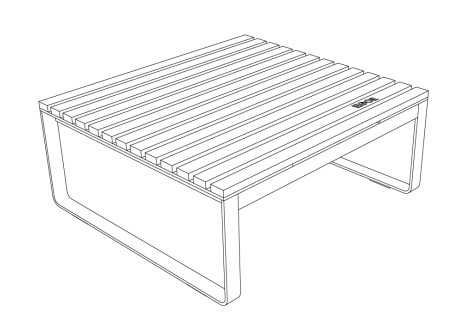
W 25" x D 23" x H 10.4"