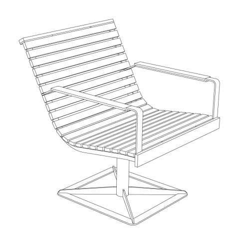
W 26.1" x D 28" x H 31.5" SEAT HEIGHT 16.1"