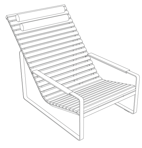
W 41.3" x D 25" x H 30.7" SEAT HEIGHT 10.4"