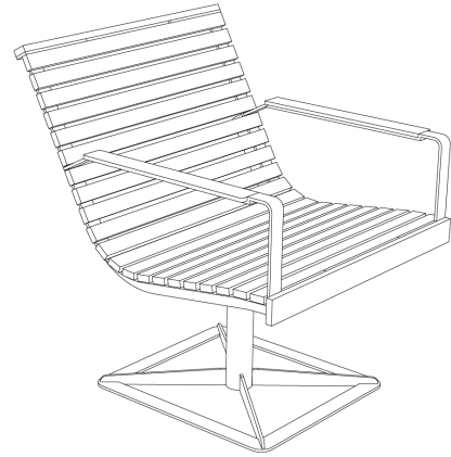
W 26.1" x D 28" x H 31.5" SEAT HEIGHT 16.1"