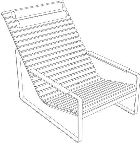
W 41.3" x D 25" x H 30.7" SEAT HEIGHT 10.4"