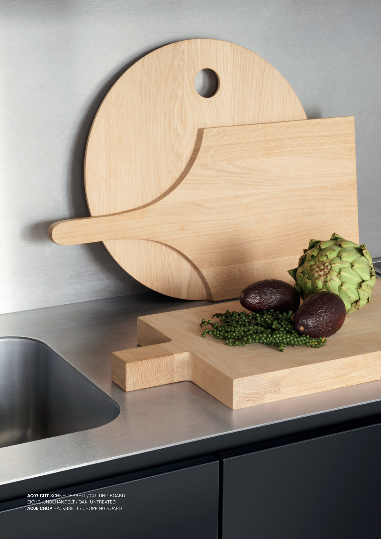
AC07 CUT SCHNEIDEBRETT / CUTTING BOARD EICHE, UNBEHANDELT / OAK, UNTREATED AC06 CHOP HACKBRETT / CHOPPING BOARD