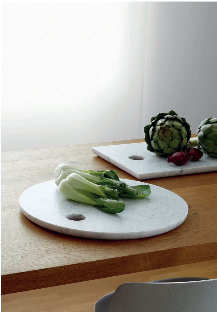
AC07 CUT SCHNEIDEBRETT / CUTTING BOARD EICHE, UNBEHANDELT / OAK, UNTREATED BIANCO CARRARA, GEÖLT / BIANCO CARRARA, OILED AC06 CHOP HACKBRETT / CHOPPING BOARD