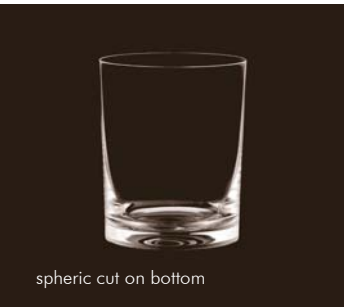
spheric cut on bottom