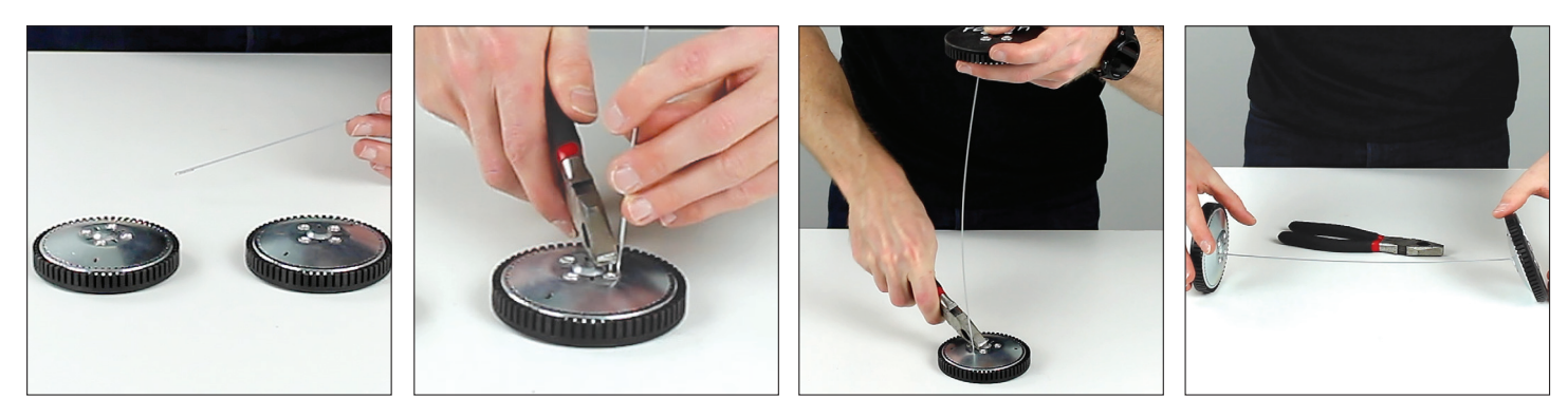
Take the centre tensioning bar and push one end into one of the four slits in the centre of the wire mounting disc. Repeat on the other wire mounting disc.