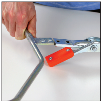
Insert R182 Cage Holder into the handle, but DO NOT FASTEN.