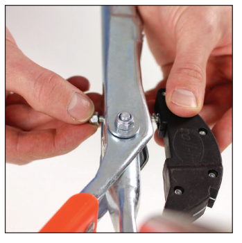
Remove the lock nut from R235 Cam and insert as shown in the above image. Secure with the lock nut, but ONLY FINGER TIGHT.