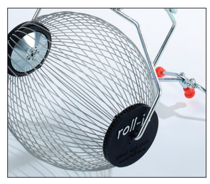
Align the holes on the ends of the cage with the cage holder and squeeze into place.