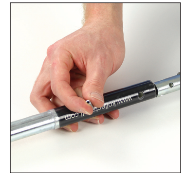
Join the two sides of the Coupler and insert into the R210 Handle Upper Section so that the hole in the Coupler is aligned with the hole in the Handle. Insert an Allen Key Screw in the Handle to secure, but do not tighten all the way.