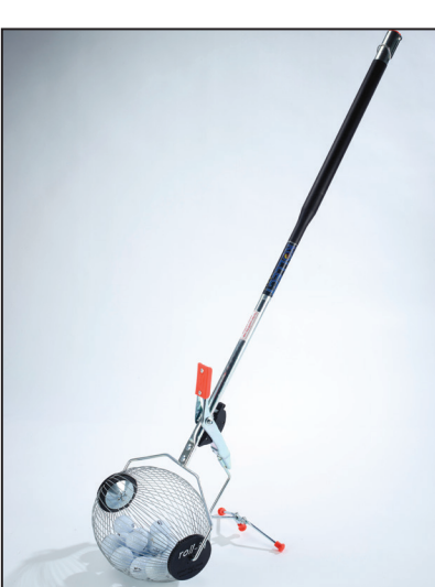
You are now ready to enjoy your Kollectaball!