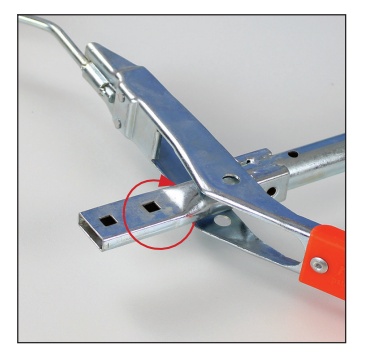
Insert the R211 Handle Lower Section through the R195 Wire Opener. With the Wire Opener in the position shown, twist the handle 90 degrees and slide the Wire Opener up so the holes on the Wire Opener and Handle are aligned.