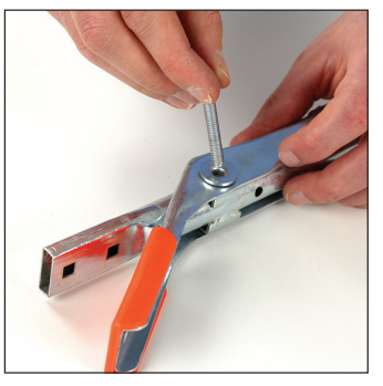
Place R178 washer on one side of the wire-opener with the flat side facing outwards and insert R198 hex screw. Place the second R178 washer on the other side and tighten the R198 screw. Fasten with R137 lock nut.