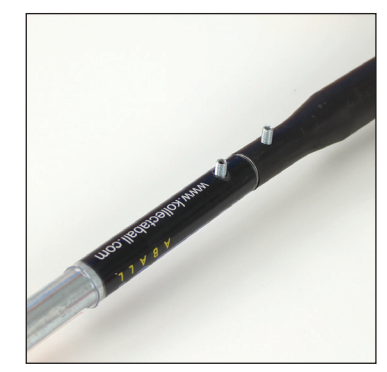
Slide the R211 Handle Lower Section over the exposed coupler so the holes align. Insert the second Allen Key Screw and tighten both using Allen Key. DO NOT OVERTIGHTEN.