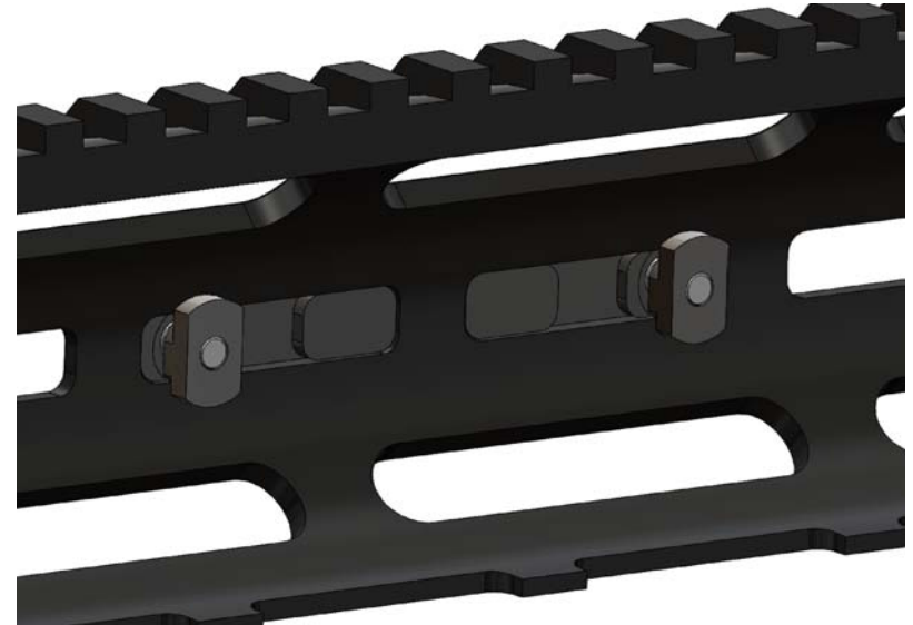
FIGURE - 3: M-LOK SECTION CUT VIEW

VISIT US AT WWW.MECHFORCE-USA.COM FOR OTHER EXCITING PRODUCTS