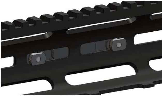
FIGURE - 2: M-LOK SECTION CUT VIEW

VISIT US AT WWW.MECHFORCE-USA.COM FOR OTHER EXCITING PRODUCTS