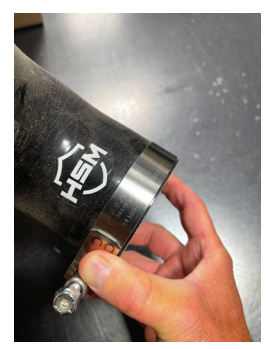
Note: Make sure when installing the clamp on the intercooler end of all boots to be sure the clamp is pushed up close against the intercooler outlet as shown, so the intercooler outlet does not cut the boot if the clamp is tightened too far out.