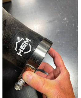
Note: Make sure when installing the clamp on the intercooler end of all boots to be sure the clamp is pushed up close against the intercooler outlet as shown, so the intercooler outlet does not cut the boot if the clamp is tightened too far out.