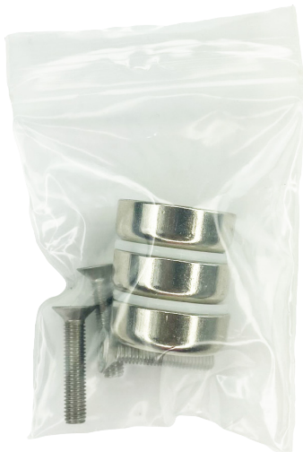
BAG OF PARTS

1. Empty out your BAG OF PARTS. You will find three stainless steel bolts and three magnets with some white spacers to protect them in transit.