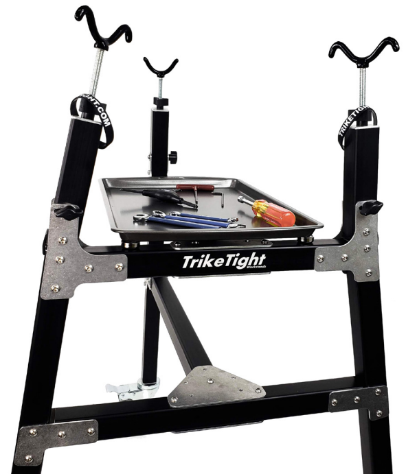
TRIKE TIGHT ROLL AROUND

4. You can now use those super strong magnets to stick you steel baking sheets or bowls or other steel containers to your work stand to help you hold stuff while you work on your trike. T-Cycle does not sell any containers like this, but they can be found in your local grocery or department store or even your own kitchen!