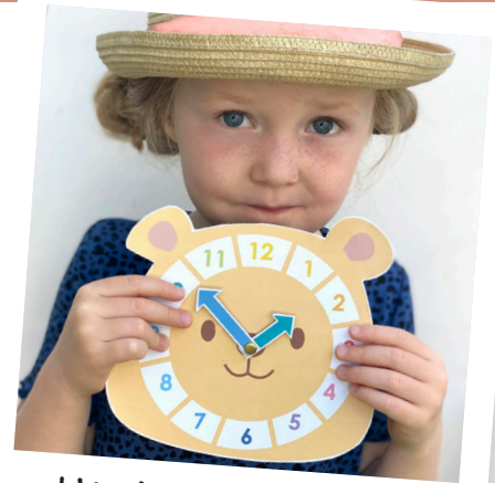
Here's one we made!