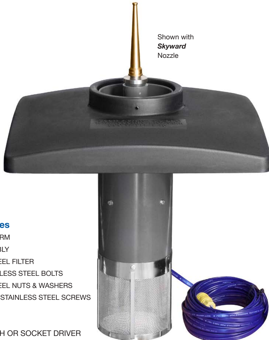
Shown with Skyward Nozzle

We at Scott Aerator thank you for your purchase. It is our goal to ensure that you are completely satisfied with your new Fountain and that it continues to operate smoothly for many years to come. Please take a few moments to read through this document for proper assembly, installation and maintenance to maximize the operating life of the unit.