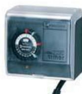
115V Timer Part #20036

Save energy while extending the life of your fountain! Timers available for 115v and 230V motors. The Timing Center by Intermatic contains two timers in one steel outdoor enclosure.