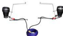
2 Light Kit Halogen Part #13505 LED Part #13605

There is nothing more majestic than viewing your fountain or aerator at night under lights. Light kits are easy-to-install and available in heavy duty, shock resistant, water cooled 120 watt par 38 Halogen floodlights or LED. GFCI required, please disconnect power when swimmers are present. Light kits can be added to your existing fountain on site as well.