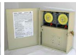
Timing Center Part #20040