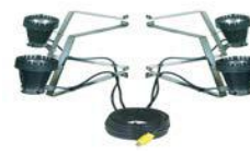
4 Light Kit Halogen Part #13509 LED Part #13609