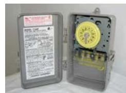
230V Timer Part #20039