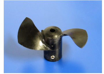
Propeller Part # 30004

Most of our products require very little to any maintenance. Under normal operating conditions, you should enjoy many years of trouble free service from the unit. As a rule of thumb, the propeller assembly on our No-Icer should be changed every five years. This is a simple procedure that can be done on-site. When the unit is removed from the water for the propeller switch, it would be a good opportunity to wash the unit down with high pressure water. Once the unit is clean, a visual inspection of the entire No-Icer is recommended to be certain nothing is restricting water flow.