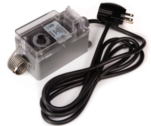
Thermostat Part # 20042

Save money on your electric bill! Introducing our De-Icer In-Line Thermostat. This outdoor, heavy duty thermostat control box allows you to set and forget your De-Icer to run when temperatures get frigid. Factory set at an outside air temperature of 30 degrees Fahrenheit, the thermostat automatically starts your De-Icer and keeps it running until the air temp warms to 31 degrees F, or higher. Fully adjustable from 0 F up to 80 F, this product is UL listed. The impact resistant enclosure and 8 foot power cord both come standard, simply plug your De-Icer in and you're ready to go.