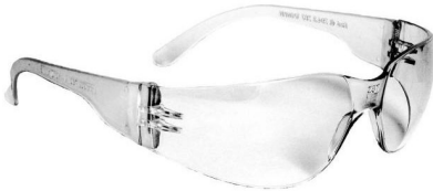
Radians MIRAGE™ Eyewear

We will suggest products based on availability.