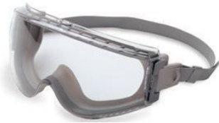
UVEX Stealth Chemical Splash Goggles