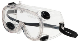
Bouton Chemical Splash Goggles