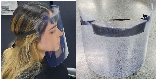
Faceshield, Clear Plastic Visor