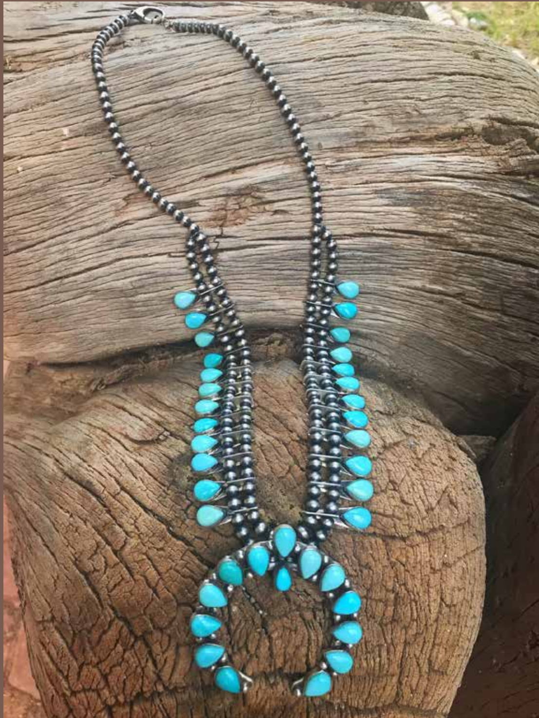
Squash Blossom Necklace Natural Carico Lake, NV Turquoise, Sterling Silver 29" Donor: Louise Pasaka/Mesas Edge