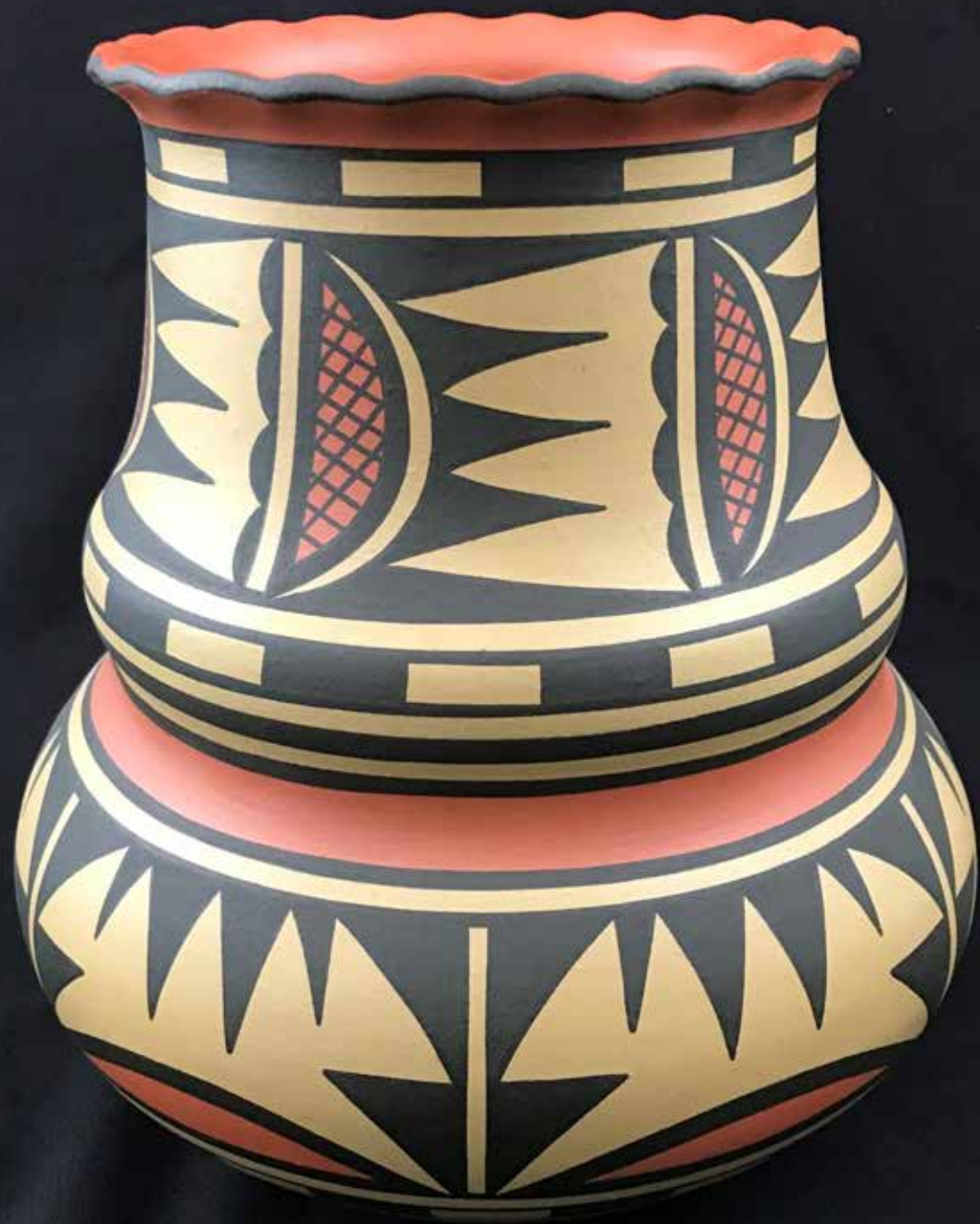
San Ildefonso Pueblo Polychrome with Fluted Top Plant Motif Turquoise Cavan Gonzales Clay Pottery and Slips 10" x 10.5" Donor: Cavan Gonzales