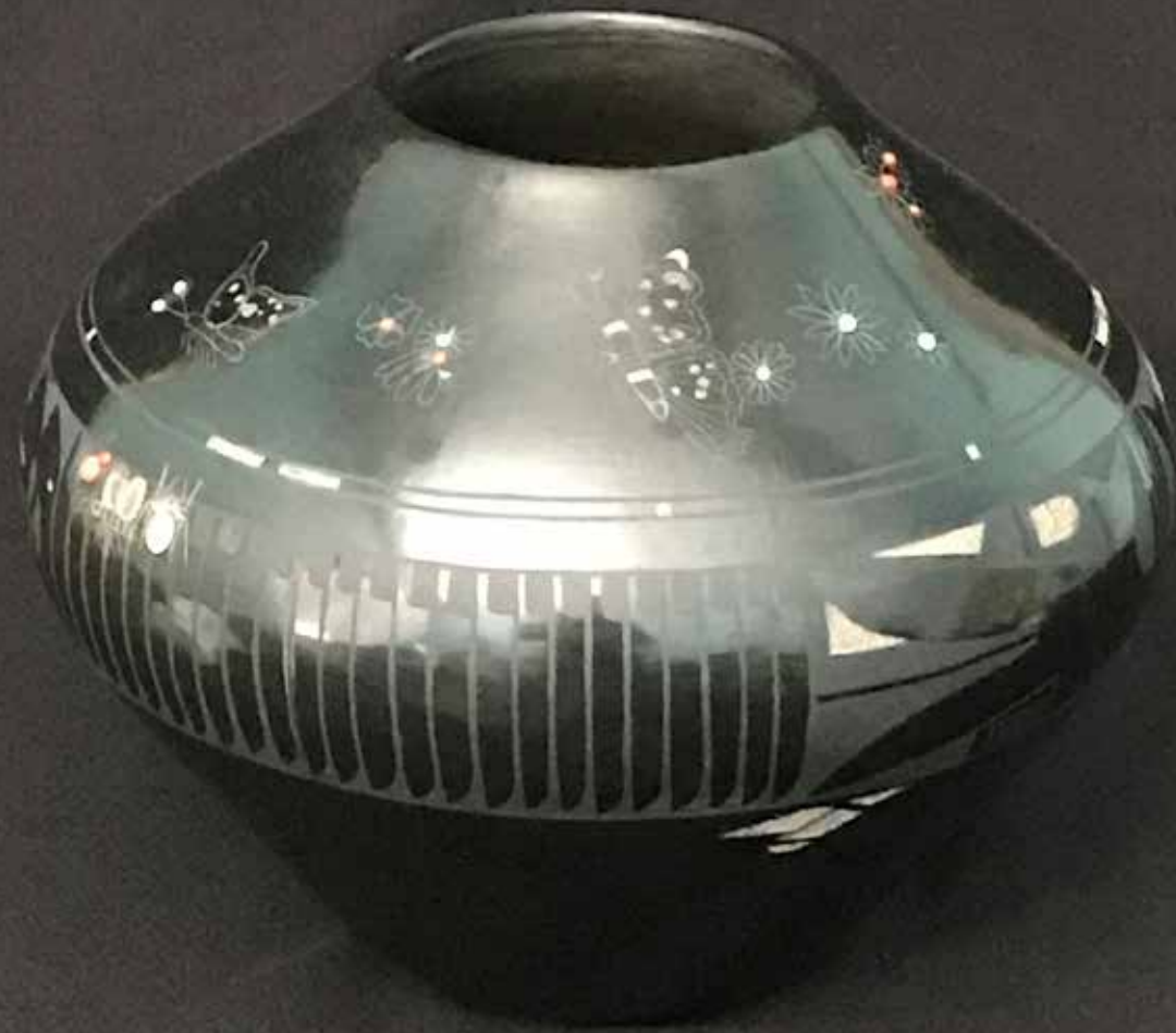
Large Black Vase Barbara "Tahn-moo-whe" Gonzales Etched, Painted, Polished Clay Pottery with 21 Gems and Shell 9" x 9" Donor: Barbara "Tahn-moo-whe"