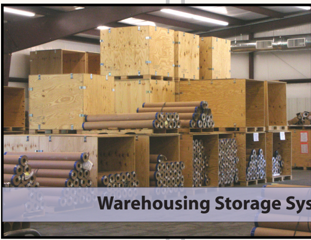
Warehousing Storage System

Quick-Crates allow you to design a complete storage system for all of your warehousing, inventory and shipping needs. Since our design has been Military tested to withstand 10,000 lbs of stacking pressure, your storage layout options are considerable. You can also use crates individually to transport and store a variety of products.