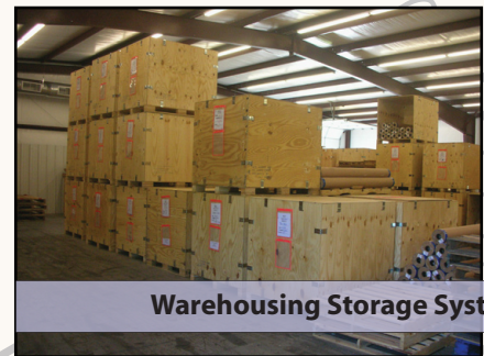
Warehousing Storage System