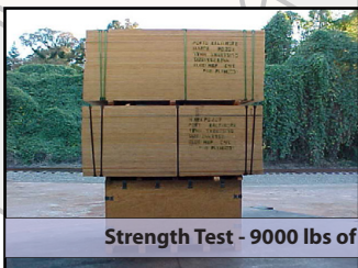
Strength Test - 9000 lbs of load